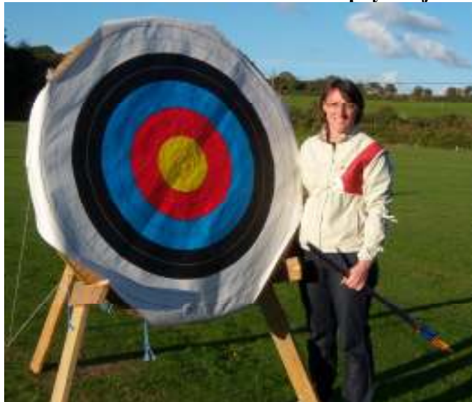
Star from "The Games", Julia has a go at Archery

Thank you to Julia Goldsworthy MP for her contribution to Redruth Archers Trophy Project.